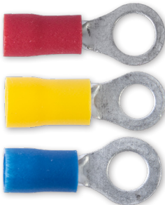
20-102, 20-106 & 20-104