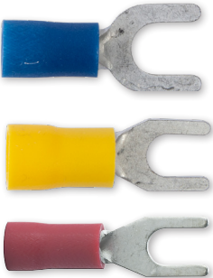
20-114, 20-116 & 15-111